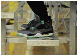
Single Foot Plank