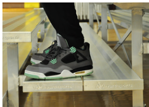
Double Foot Plank

ALL ALUMINUM STANDARD BLEACHER ALL ALUMINUM PREFERRED BLEACHER STEEL FRAMED BLEACHER LARGE CAPACITY BLEACHER